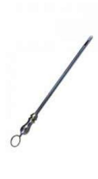
Teat Instrument AS-9502