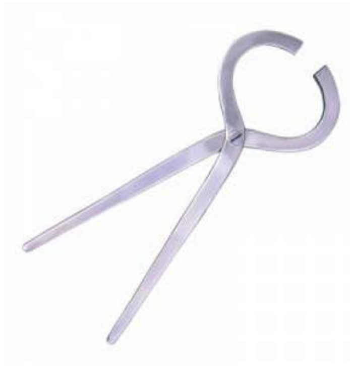
Hoof Knife AS-9101