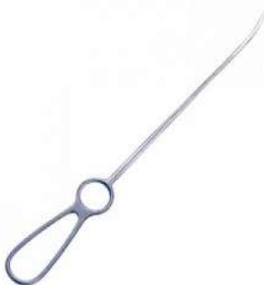
Teat Instrument AS-9507