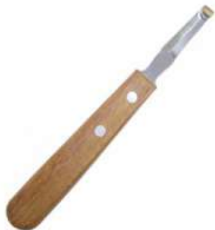
Hoof Knife AS-9104