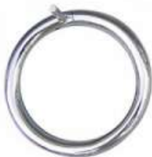
Bull Nose AS-9205