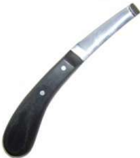
Hoof Knife AS-9103