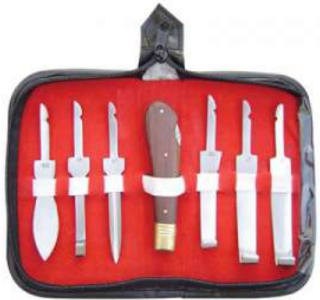
Hoof Knife AS-9102