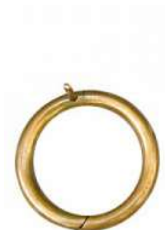
Bull Nose AS-9204