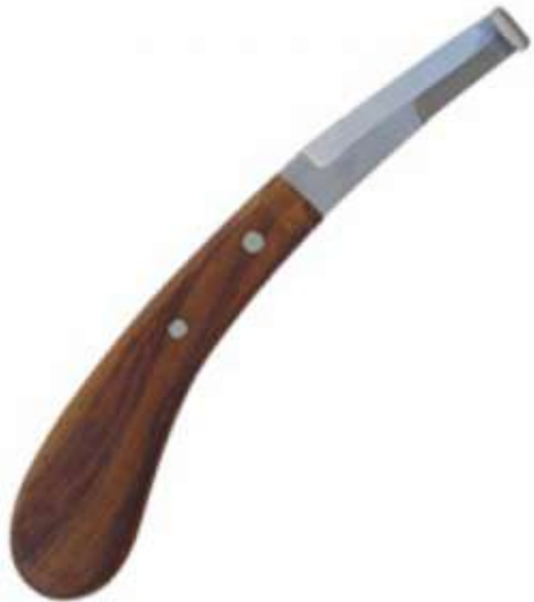
Hoof Knife AS-9106