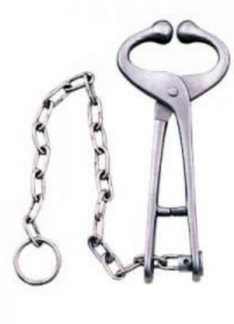
Bull Nose AS-9202