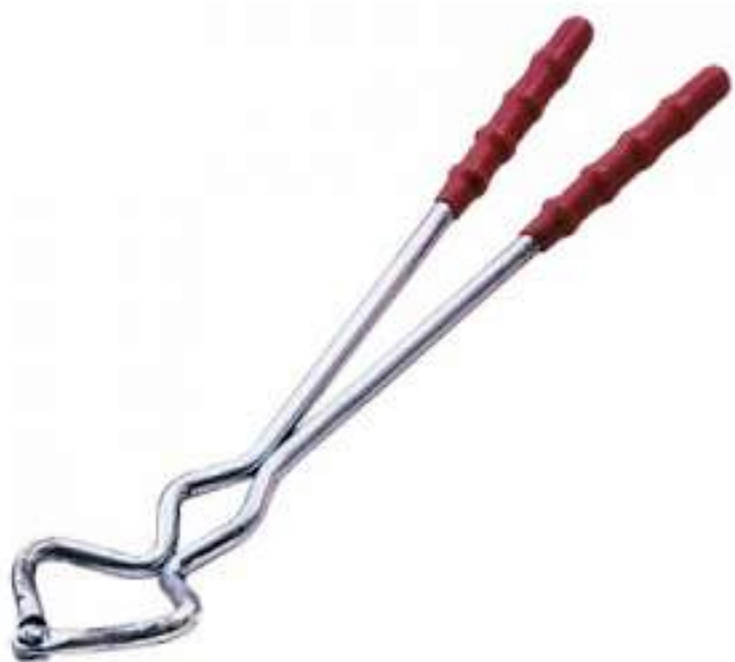
Bull Nose AS-9206