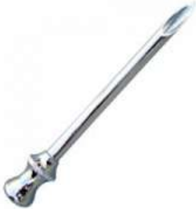
Teat Instrument AS-9505