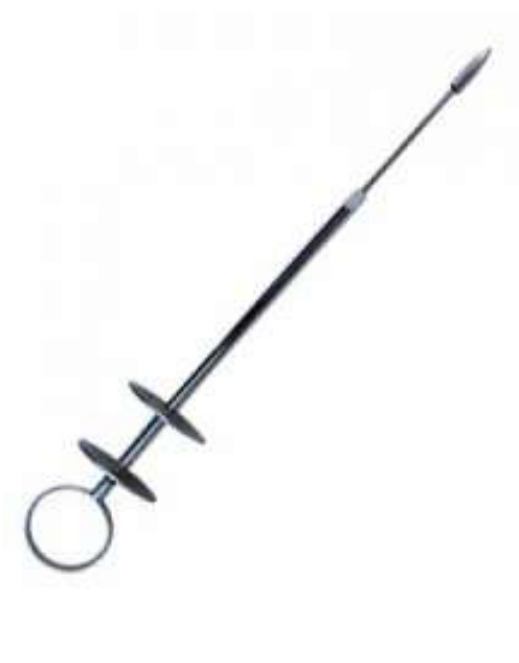
Teat Instrument AS-9503