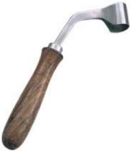
Hoof Knife AS-9105