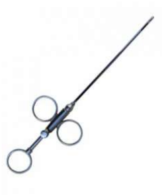
Teat Instrument AS-9501