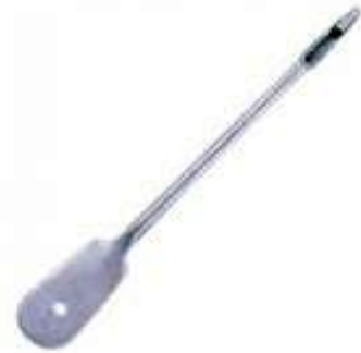
Teat Instrument AS-9506