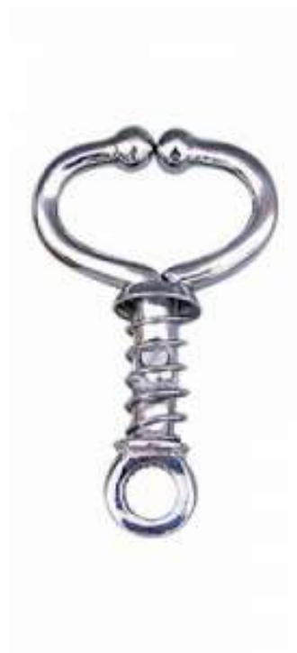
Bull Nose AS-9201