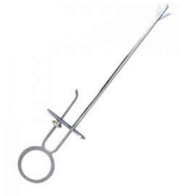
Teat Instrument AS-9504