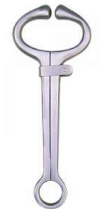
Bull Nose AS-9203